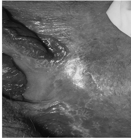
FIGURE 2. Wickham's striae.

Other variants of lichen planus may affect the vulva. Papulosquamous LP is classically described as small, intensely pruritic,