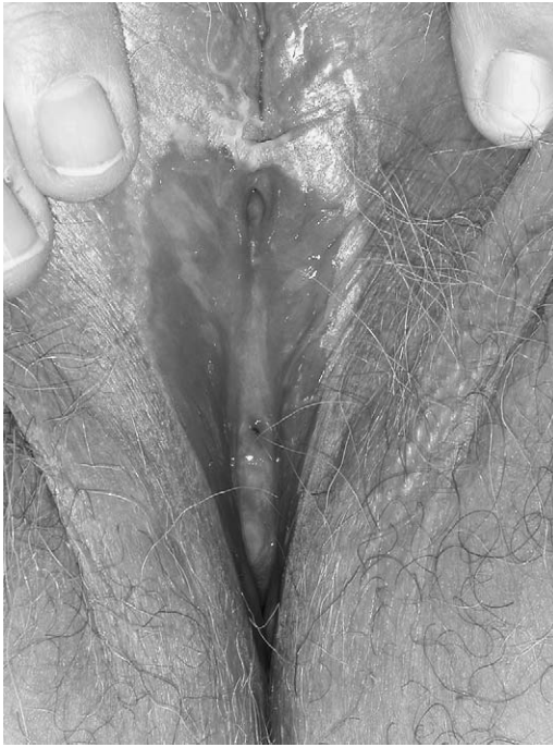
FIGURE 1. Erosive lichen planus of the vulva and vagina.

LP. 7,8 Women with erosive LP of the vagina typically have a copious yellowish discharge composed of lymphocytes and immature epithelial cells of the vagina called parabasal cells. 6 The vaginal discharge may also be exudative, pseudomembranous, or serosanguinous. 7 In addition, in cases of severe erosive LP affecting the vagina, synechiae may form between the vaginal walls and may partially, or completely, obliterate the vaginal lumen.